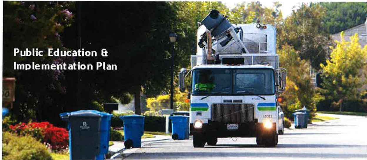
EXHIBIT C: PUBLIC EDUCATION PLAN